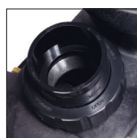
Unions kit included (50/63 mm)