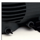
Double drain with easy opening (no tools required)