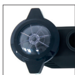
See-through Twist-Lock strainer cover