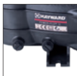
Drainage caps to make wintering easier