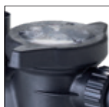
Easy access to the pre-filter through the quarter turn cover