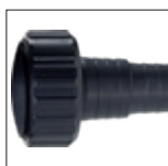
50 mm outlet or \phi 32/38 mm fluted adapters