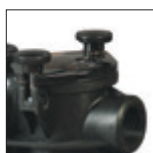
See-through strainer cover