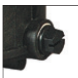
Drain plugs for an easy wintering