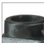
In / Out 1.5"