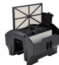
Top access to filter panel for simple maintenance. The filter panel is easy to remove, easy to clean and easy to replace.