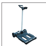
The supplied trolley allows you to move and store the cleaner quickly and easily.