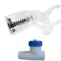
Dépressiomètre et vanne de réglage