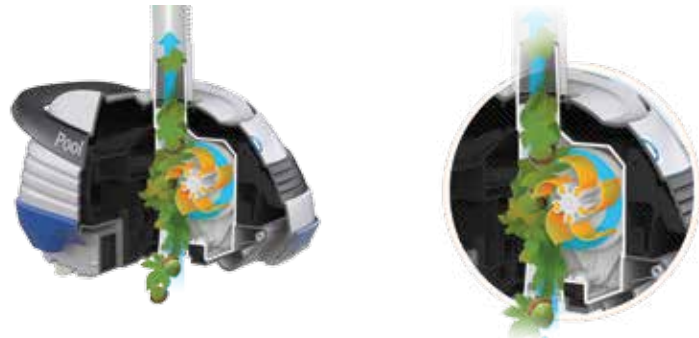
V Flex™ patented technology: turbine with moving vanes to capture large debris

Its wing design improves the suction of all kinds of debris