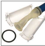
Diaphragm technology provides years of quiet and efficient operation