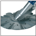
Additional side port intakes pick up debris in a single pass