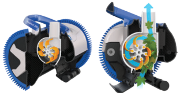
V Flex™ patented technology features a turbine with flexible blades to capture large debris.