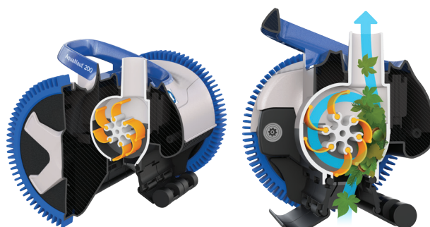
V Flex® patented technology features a turbine with flexible blades to capture large debris.