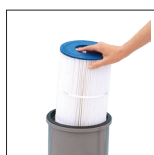
Easy-to-remove filter cartridge

10 5 TOTALLY PARTNER ON THE TANK EQUIPEMENTS +1