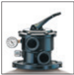
Sand easily accessible by removing the collar