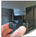
Drain with plug that also serves as a dismantling tool