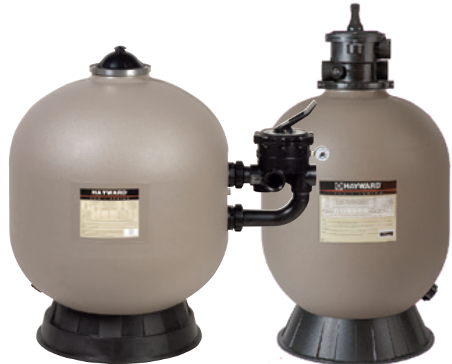
Pro-Series™ HB Side