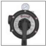
Vari-Flo™ 6-position valve