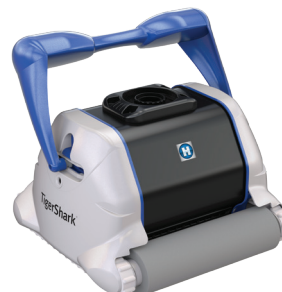
TigerShark® foam version