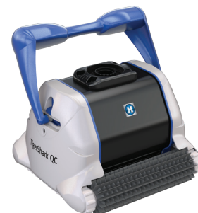
Tigershark® QC conical rubber brush