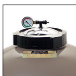
180 mm diameter threaded opening for simpler maintenance operations