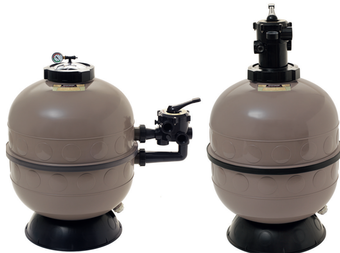
ProSeries™ HI Side