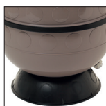
Circular base for perfect filter stability